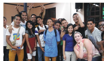
George Mason U students with Sillimanians