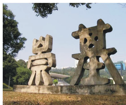
Chung Chi College landmarks

with the United Board for Christian Higher Education in Asia and the Department of Social Work and Social Policy of Nankai University in Tianjin province in China. It aimed at providing scholars and practitioners a platform to exchange