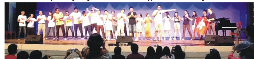
Students from China, Hong Kong, Macau and China perform together at the cultural night