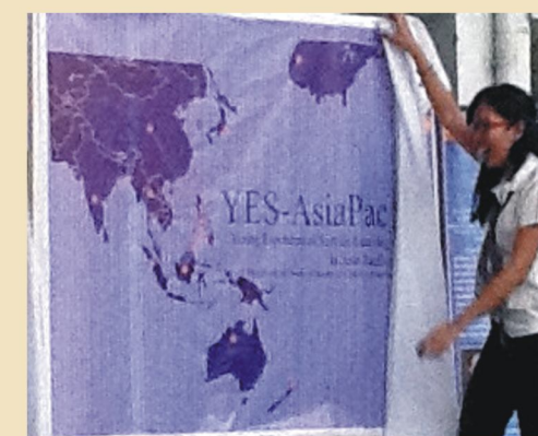
The unveiling of the poster of YES Asia-Pac, which promotes online sharing of S-L experiences

Visit Yes AsiaPac on Facebook or its website https://www.facebook.com/groups/1458809981016866/