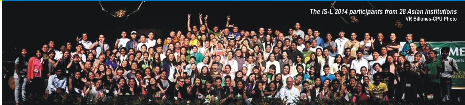
The IS-L 2014 participants from 28 Asian institutions

My students and I will always remember our learning experiences in the Philippines, she said.