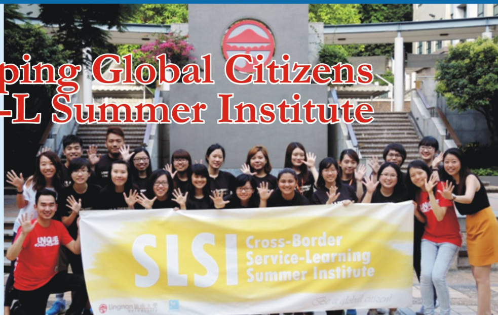
The Lingnan S-L Summer Institute 2014 participants, photos above and below

During their stay in Hong Kong, the students engaged in community service exposures and practicum