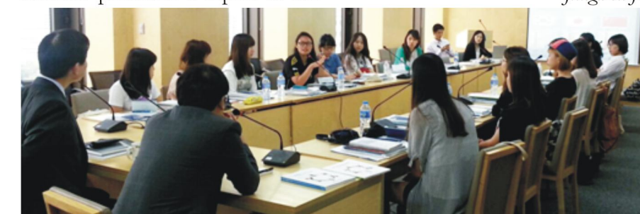
The Trilateral Cooperation Secretariat workshop in Seoul