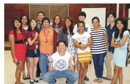
ICU students with their hosts

Silliman also participated in the International Service-Learning Conference and Community Engagement.