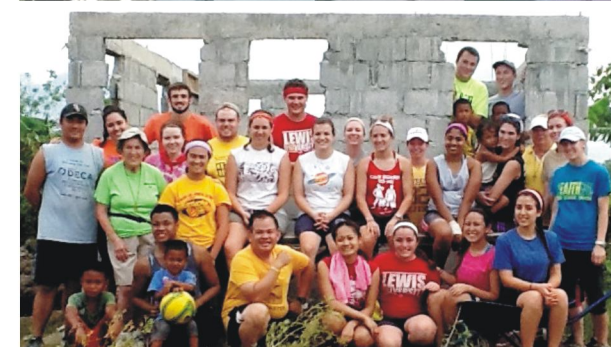
The Joliet Diocese University Mission from six universities in Illinois, U.S.A.