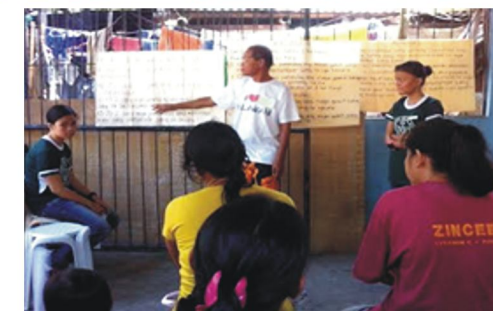
Presentation of the result of an S-L community study and, upper right photo, Materials Engineering students demonstrate recycling of polymeric materials