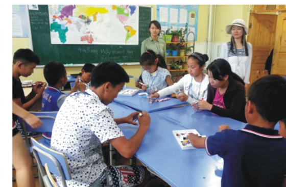
Mongolian kids, with SWU students, make Time Capsules for their dream messages; right, a team-building activity

The trip was coordinated with ‘Asian Friends’, an international non-government organization and a partner of SWU.