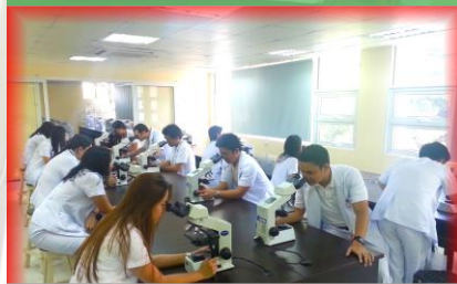
BASIC SCIENCES LABORATORY 2 — MICROSCOPY