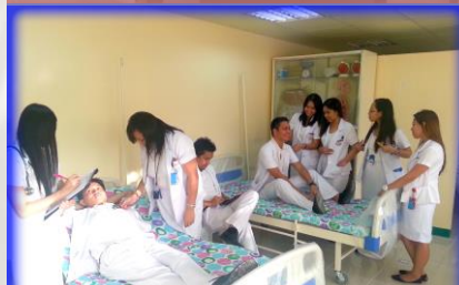
BASIC SCIENCES LABORATORY 3 — SKILLS LABORATORY