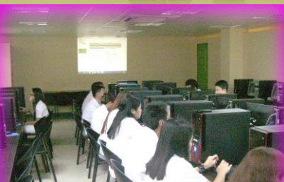
LEARNING RESOURCE UNIT