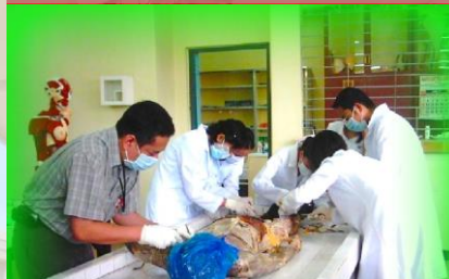
BASIC SCIENCES LABORATORY 1 — ANATOMY